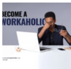
BECOME A WORKAHOLIC