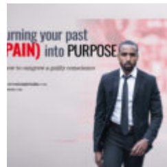
TURNING YOUR PAST