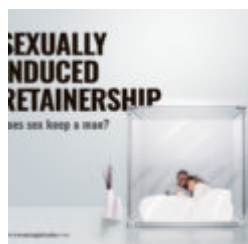
SEXUALLY INDUCED RETAINERSHIP