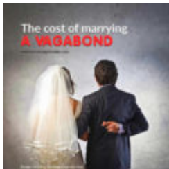
THE COST OF MARRYING A VAGABOND