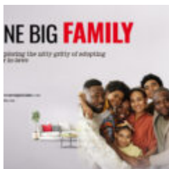
ONE BIG FAMILY