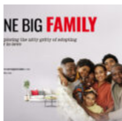
ONE BIG FAMILY