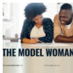
THE MODEL WOMAN