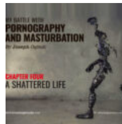
FROM MY PERSONAL JOURNEY OF SEXUAL PURITY.