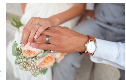
PORNOGRAPHY AND MASTURBATION: CHAPTER FOUR: A SHATTERED LIFE