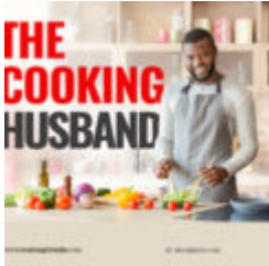
THE COOKING HUSBAND