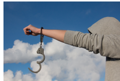
Ten Reasons Not To Engage in