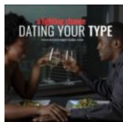
CANNOT DO WITHOUT SEX