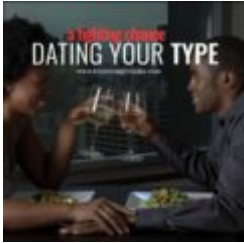
DATING YOUR TYPE