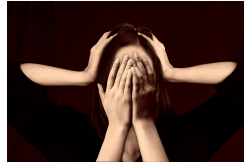
Naked and Not Ashamed: Further