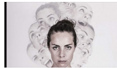
Engage in Premarital Sex: Reason Eight - False Impressions